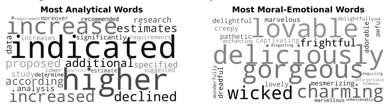
Figure 1: Words Most Similar to the Analytical and Moral-Emotional Poles

Note: Words are weighted by the their cosine similarity to the respective pole.